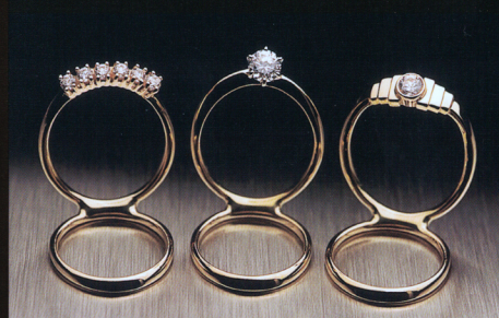
Model 103 in 14k gold, six diamond tierra. 14k gold only.