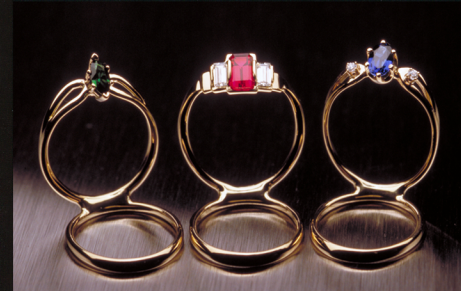
Model 106 in 14k gold, marquise emerald.