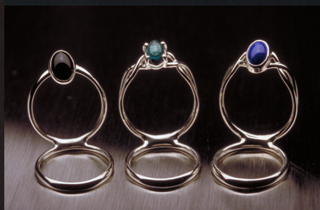
Model 109 in sterling silver, cabochon black onyx.