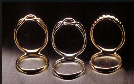
Model 101 in 14k gold.

Please be aware these are "special order" splints and require initial fit verification.